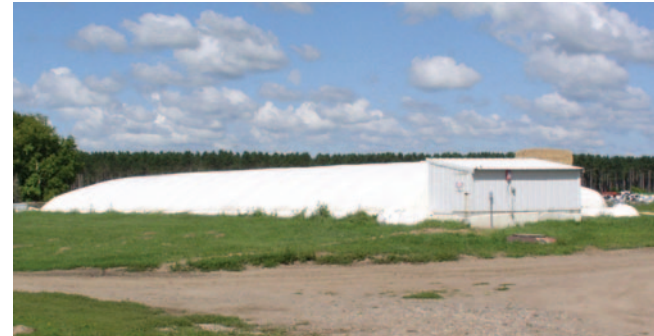
Plug flow digester

Using a plug flow digester, animal waste is introduced into one end of a long, tubular digester and moves toward the other end. As the waste is digested and flows out the tail end, more waste is introduced on the front end. Plug flow digesters have mainly been used on dairy farms, due to their ability to handle slightly higher solids contents. Plug flow digesters are workable with manure containing 11 to 13 percent solids, and are well suited for operations that mechanically scrape out manure from barns. As evidenced in the table above, the plug flow design is, of yet, the most popular anaerobic digester design.